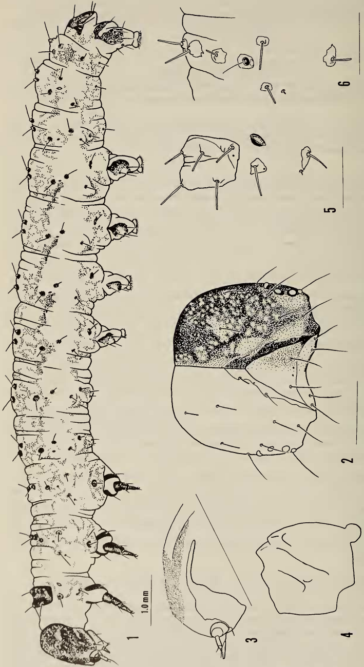
FIGS. 1-6. Phalaenophana extremalis larva: 1, lateral habitus; 2, frontal view of head; 3, lateral view of hypopharyngeal complex; 4, oral aspect of left mandible; 5, left dorsolateral setal arrangement of prothorax; 6, left dorsolateral setal arrangement of mesothorax. Scale lines = 0.5 mm except as noted.